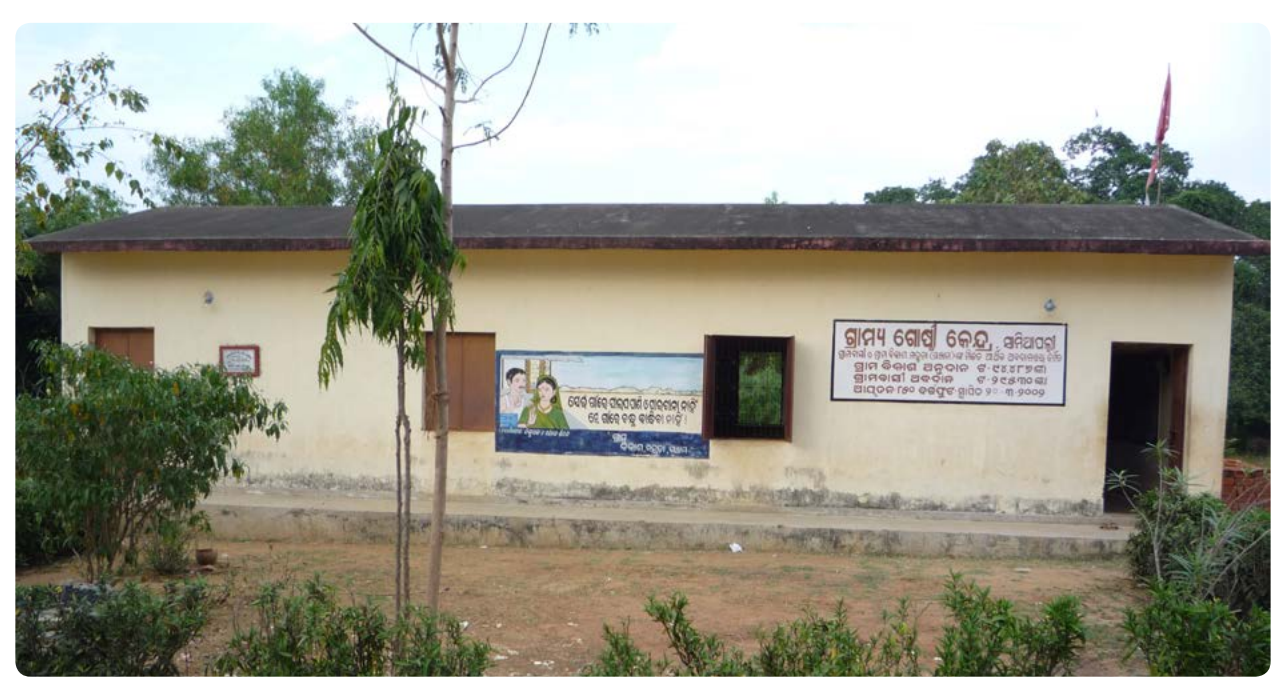
NaterAid/ Gram Vikas