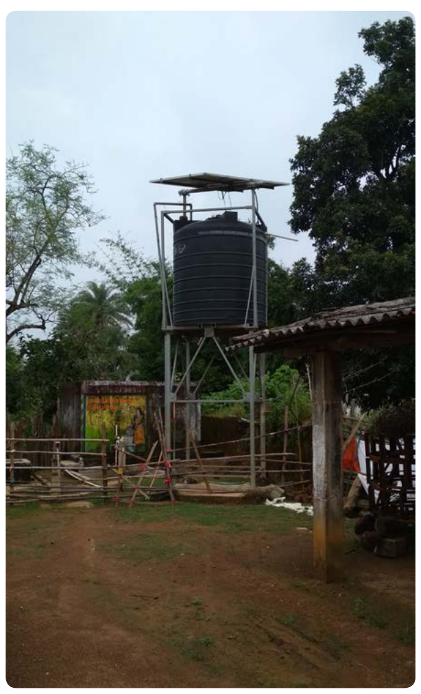
Overhead water storage tank in Sivani Panchayat, Kanker, Chhattisgarh