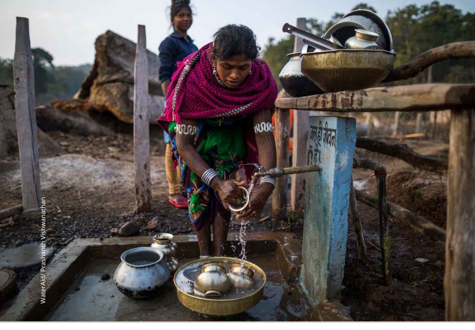
A baiga woman collects water from a stand post at Kapoti Village, Dhindori, Madhya Pradesh